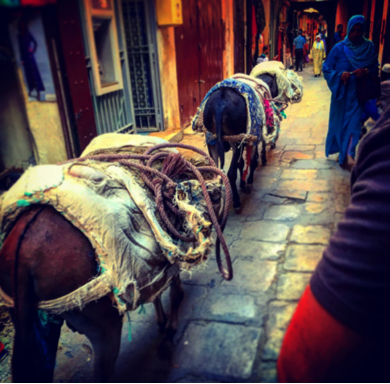
Donkeys in the Medina of Fes.