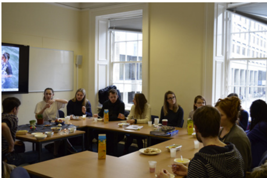
Students enjoying the Naw-Rúz feast.