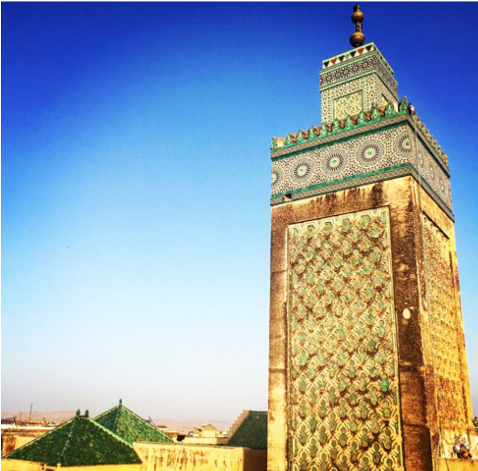
Minaret at the Bou Inania Madrasa, Fes.