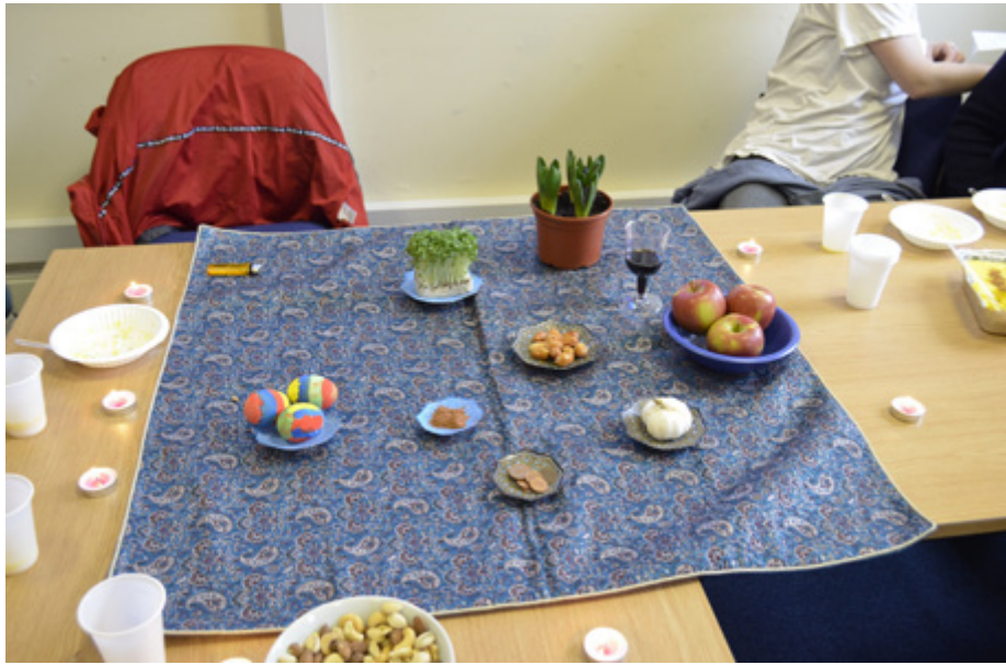
The Naw-Rúz Spread, known as the haft-seen sofreh.