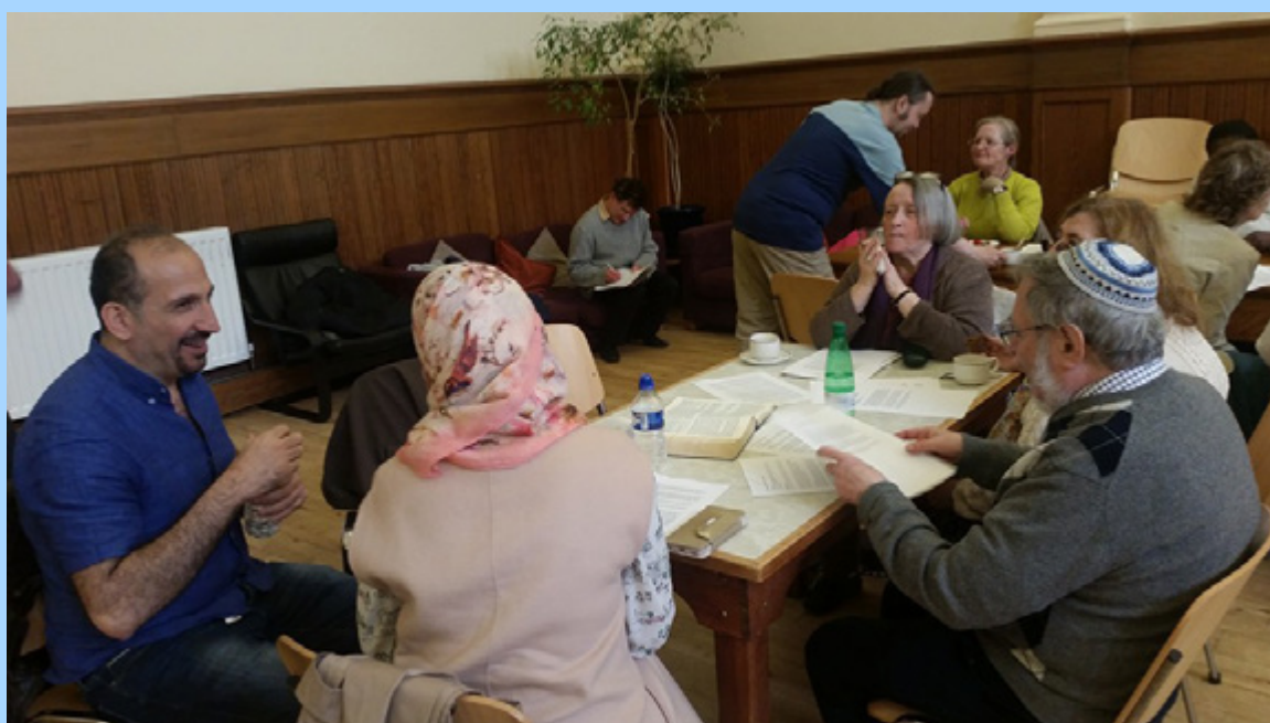
Jews, Christians and Muslims come together to discuss their scripture at the latest ‘Breaking Barriers’ scriptural reasoning session.

The Centre has also put together a comprehensive guide to all events taking place during the Edinburgh Festivals in August which have a relevance to Islam or the Islamic world. These include stand-up comedy, theatre, music and conversation events. The full list can be downloaded from the homepage of the Alwaleed Centre’s website: www.alwaleed.ed.ac.uk .