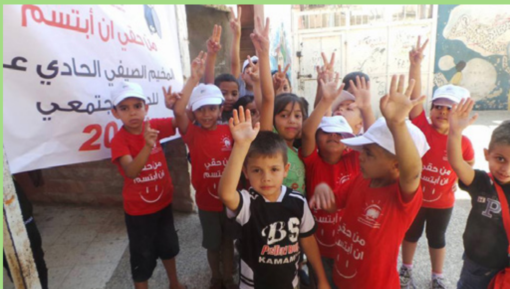
Children taking part in activities at Al-Amari refugee camp.

https://www.indiegogo.com/projects/integration-summer-camp-at-al-amari-refugee-camp#/.