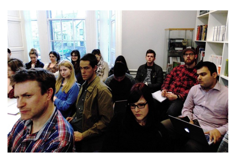
The audience of Dr Sherstobitov's seminar

This seminar discussed the 'Cartel party theory' developed by Katz and Mair, which indicates that parties cooperate between themselves to define areas of interest and limit political competition, and emphasizes the role of the state in party development. Generally the cartel theory has only been used to explain party strategies in